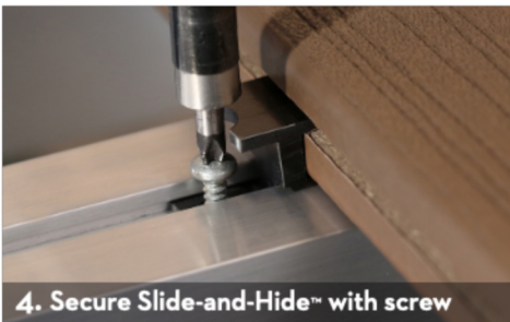
4. Secure Slide-and-Hide™ with screw