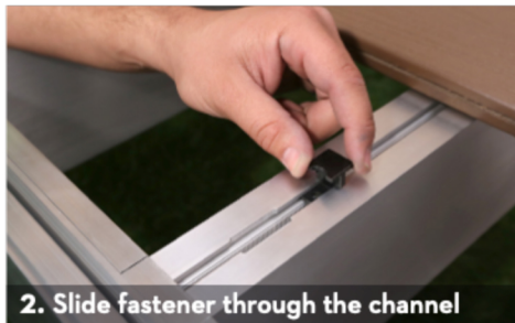
2. Slide fastener through the channel