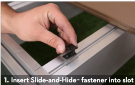
1. Insert Slide-and-Hide™ fastener into slot