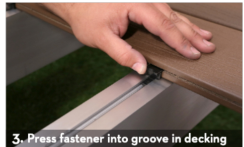
3. Press fastener into groove in decking