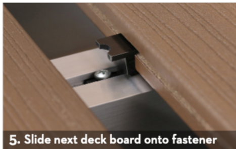
5. Slide next deck board onto fastener